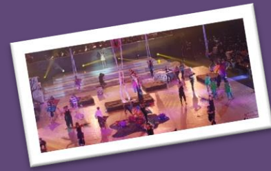
Southern Stars, Wollongong Entertainment Centre, 31 August 2018